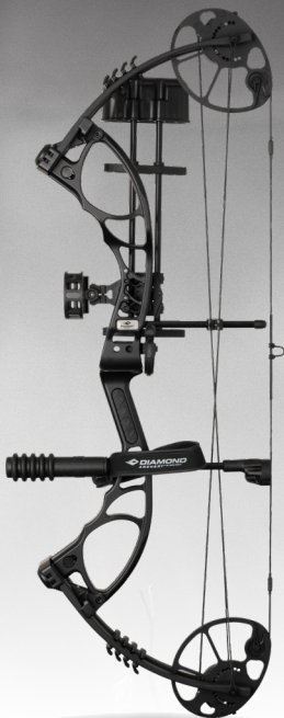
EDGE XT ™